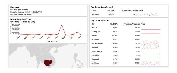
Figure 2: An automatically generated report a disruption event that occurred on October 30, 2019 at 2:00 p.m.

line (Figure 1B). This is useful for identifying countries that have experienced similar disruption patterns.