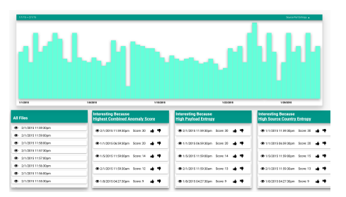
Figure 1: A visualization with idealized data of the framework presented in this paper. Note the 3 main visual components: first, a time series view of features displays information about the raw feature data. On the bottom left, there exists a list of time windows that open an existing interface for inspection of raw data. A series of contextualized anomaly detections stretches in the remaining space along the bottom of the display to collect feedback on cue-relevance for adaptation.